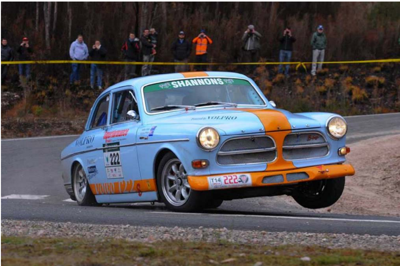
Tyre conservation coming off of Mt Roland